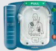
Philips HS1 AED