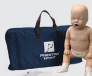
Prestan CPR Training Baby Manikin