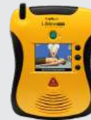
Defibtech Lifeline View AED