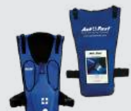
Anti Choking Trainer