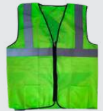
Safety jacket green