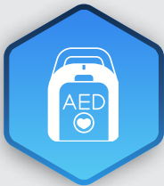
AEDs & Supplies