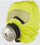
Fire Escape Hood