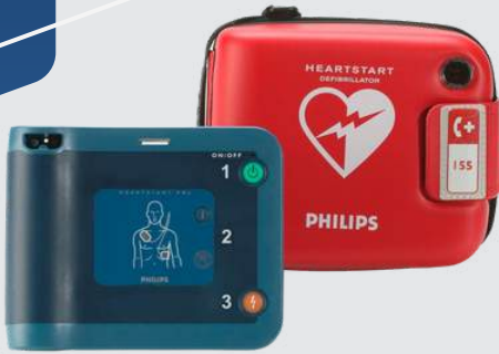
Philips FRX AED