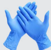
Nitrile Hand Gloves