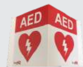
AED 3D Signage