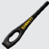
Metal detector wand