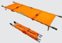
Aluminium Stretcher 4 fold