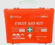
First aid box 1500