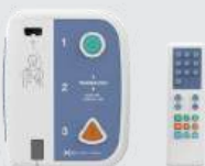
AED Trainer XFT 120