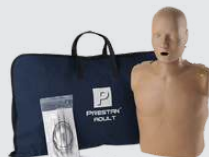
Prestan Adult Manikins