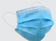
Venus 3 Ply mask