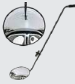
Under vehicle Inspection Mirror