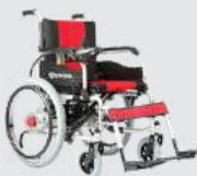
Motorised Wheel Chair