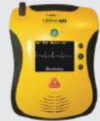
Defibtech ECG AED