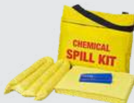
Chemical Spill kit