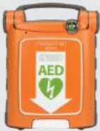
Cardiac Science G5 AED