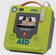
Zoll AED 3