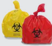
Infectious Waste Bag