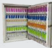
Key cabinet 100 keys