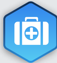
First Aid Supplies