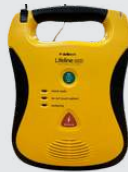
Defibtech Lifeline AED