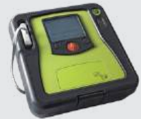
Zoll AED Pro