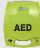
Zoll AED Plus